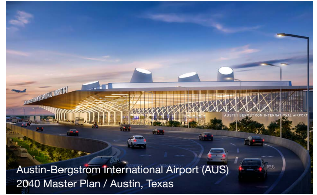
Austin-Bergstrom International Airport (AUS) 2040 Master Plan / Austin, Texas