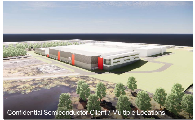
Confidential Semiconductor Client / Multiple Locations