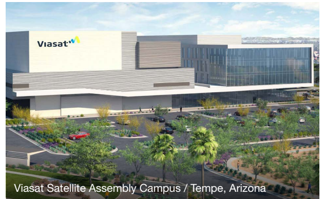
Viasat Satellite Assembly Campus / Tempe, Arizona